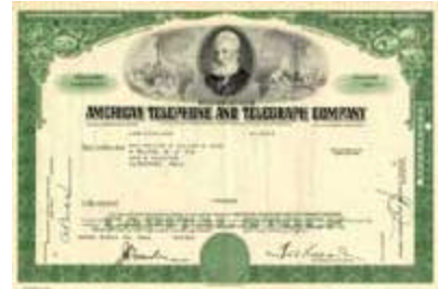
Example stock certificate ( Click to enlarge )

A stock is represented by a stock certificate. This is a fancy piece of paper that is proof of your ownership. In today's computer age, you won't actually get to see this document because your brokerage keeps these records electronically, which is also known as holding shares " in street name ." This is done to make the shares easier to trade. In the past when a person wanted to sell his or her shares, that person physically took the certificates down to the brokerage. Now, trading with a click of the mouse or a phone call makes life easier for everybody.